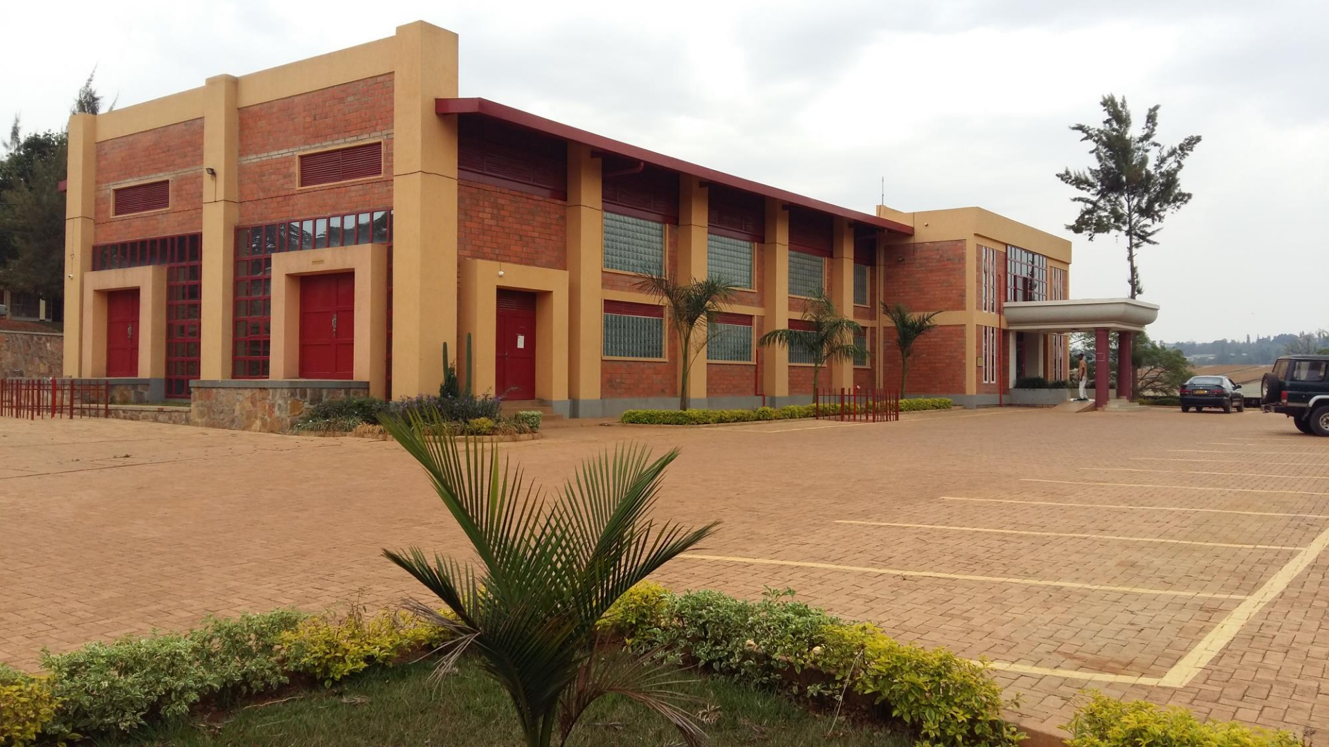
RWANDA FARMERS COFFEE COMPANY Factory premises, in Kigali-Rwanda